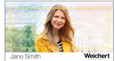
¾ lifestyle photo utilizing the background in the original photo

Looking at the Sales Associate “personal” brochure, your format depends on whether you choose the Band collection or the Frame collection. Both of them utilize the new personal bio and have the Work, Live, Play and Help content blocks.